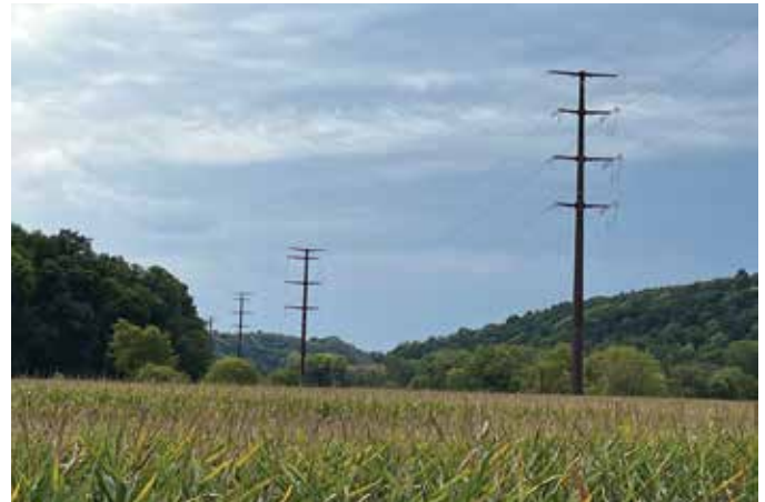
Pictured above: A portion of the Cardinal-Hickory Creek transmission line in Grant County, WI.

Wis. Dairyland is a 9 percent owner of the line with ATC and ITC Midwest. By the time Cardinal-Hickory Creek was placed in service, there were 160 renewable generation projects totaling 24.5 gigawatts dependent upon the line.