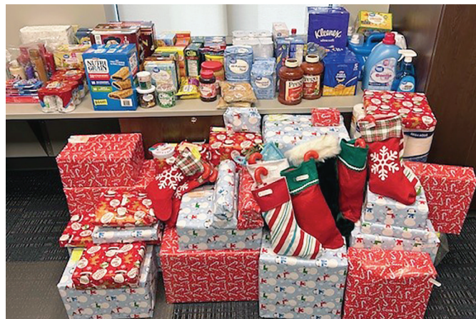
Scenic Rivers Energy Cooperative employees put the seventh cooperative principle—Concern for Community—in action last month when they collectively adopted a family through the Grant County Family Holiday Project.

Everyone at SREC wishes a Happy New Year to our own, wonderful community.