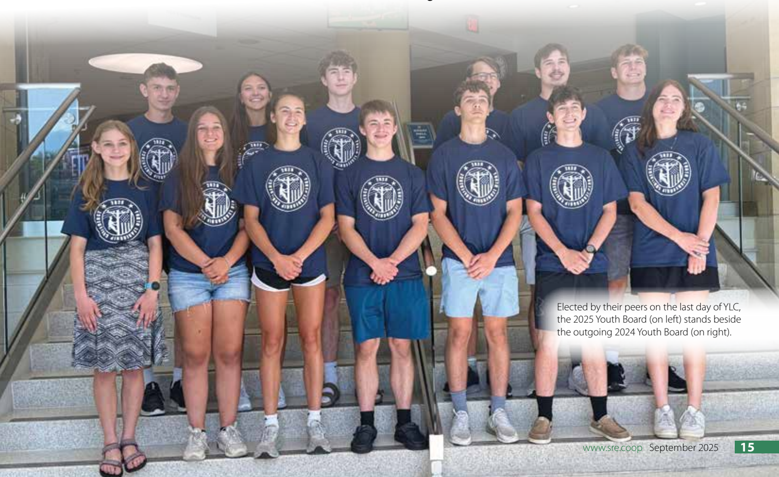
Elected by their peers on the last day of YLC, the 2025 Youth Board (on left) stands beside the outgoing 2024 Youth Board (on right).