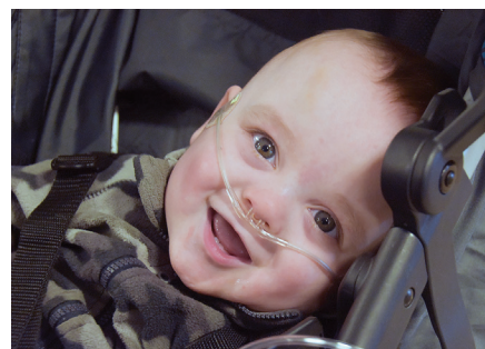
The youngest member in attendance was full of smiles!

The full recording of the annual meeting is available on our website at www.sre.coop .